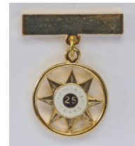
25 & 50 Brooch