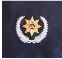
25 & 50 Monogram