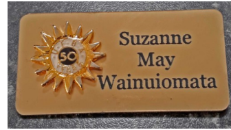
Name tag Available with 25 and 50