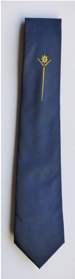
25 & 50 Tie

The Association has a range of merchandise to purchase examples of which are;