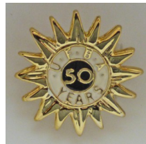
50 Lapel Badge