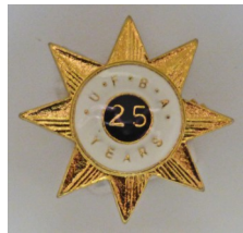
25 Lapel Badge