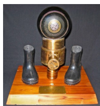
Gum Boot Trophy

Our host for Lawn Bowls in 2021 is Foxton Fire Brigade. Look forward to seeing you there